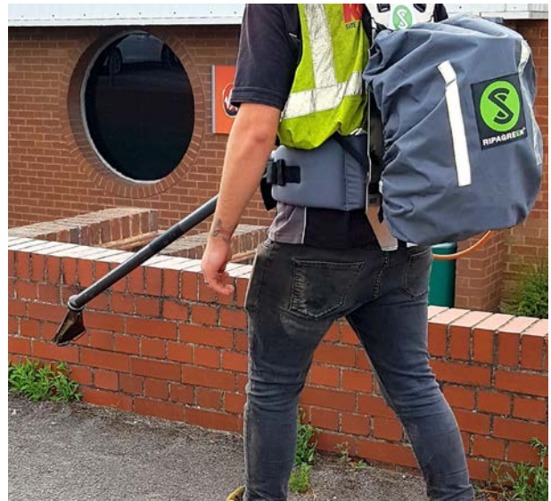
Ripagreen Thermal Heat Lance by Kersten UK

Flame weeding was once a very popular option, particularly in Europe, but due to a variety of concerns about health and safety and carbon emissions their use has declined. However,