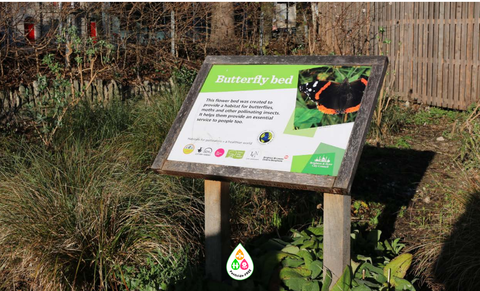
Areas left to grow wild for insects - The Level in Brighton