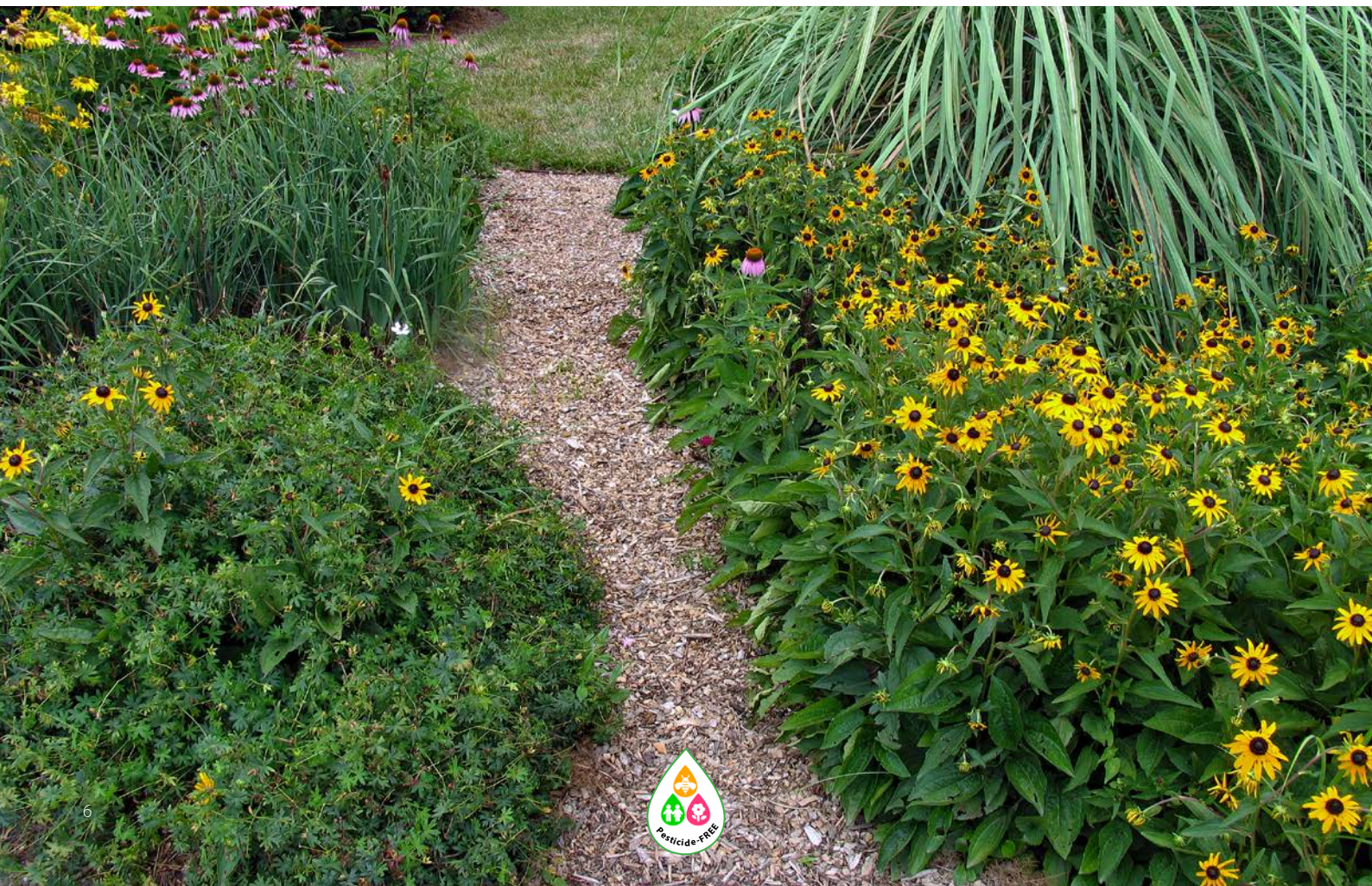
Mulching to keep weeds at bay.

A more aesthetically pleasing approach is to use vegetation traditionally labelled as 'weeds' as display plants. Many of these so called 'weeds' will be native species, ideally suited to local conditions, and bring benefits for bees and other pollinators. In addition, these plants will often produce beautiful displays of flower and foliage that are able to compete aesthetically with more traditionally accepted ornamental plant varieties.