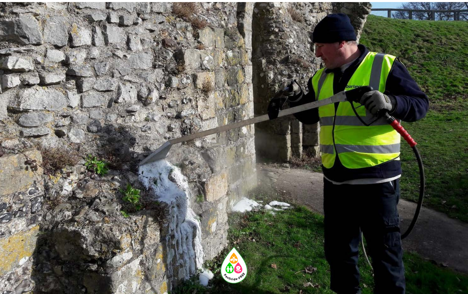
Burleys (now part of idVerde) using Foamstream to kill weeds

In addition, because the materials are inert they can be used in situations where herbicides cannot such as next to water courses or in rain