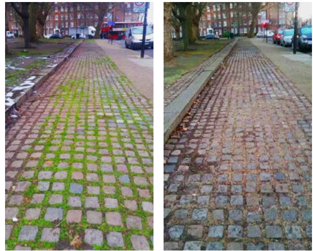
Using Foamstream to clean a cobbled street.

Both of these systems use non-toxic materials to achieve their results which means that neither has to be licensed under any of the existing pesticide regulations in the UK – including requirements for operator training and certification.