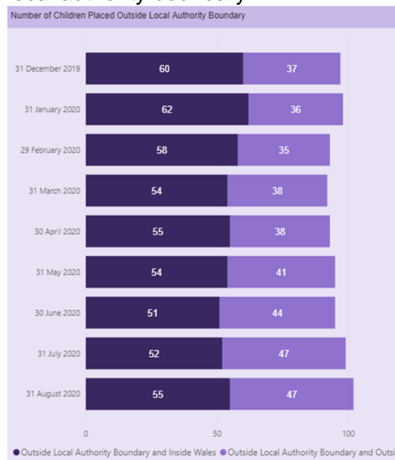
Graph 3 – Number of Children Looked After in residential care placed outside local authority boundary.